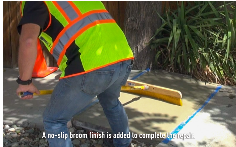
A no-slip broom finish is added to complete the repair.

Manufactured Under Patent in the USA by Global Sealer Technologies International GST International, Sparks, NV (775) 829-2626