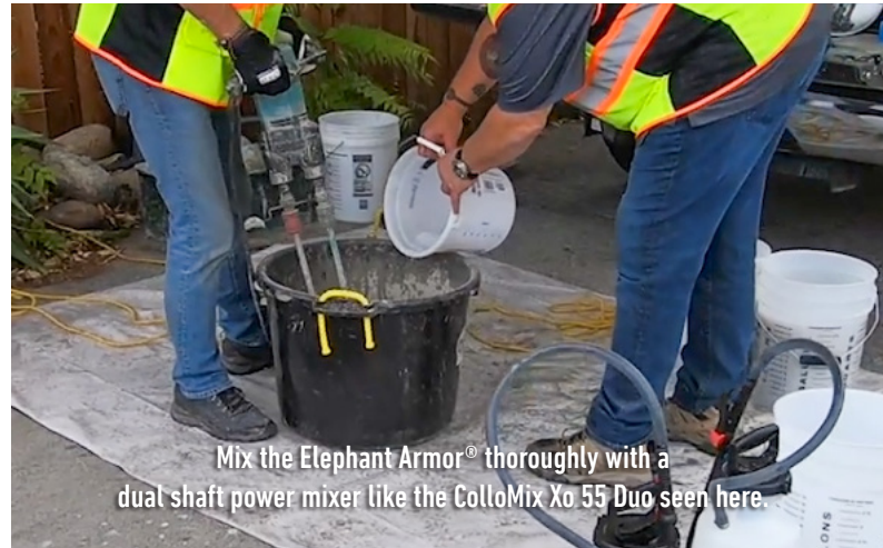
Mix the Elephant Armor® thoroughly with a dual shaft power mixer like the ColloMix Xo 55 Duo seen here.