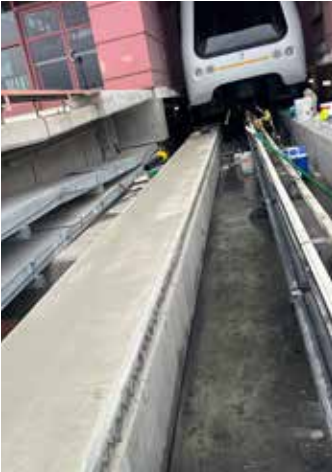
Ecobeton®-USA Vetrofluid® sprayed on prior to Surface Armor™ application.