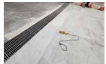
Finished repair ready for a coat of Ecobeton-USA Vetrofluid®.