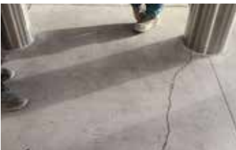
Sidewalk panel prior to crack fill with first Surface Armor™ coat.