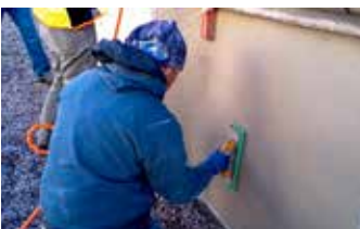
Using a grout float to apply the desired finish prior to the final application of Vetrofluid®.