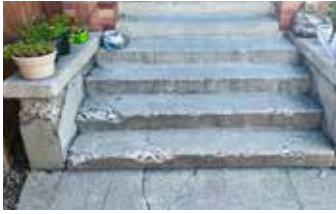
Severely spalled and degraded stairway, properly cleaned and sealed with Ecobeton® Vetrofluid®