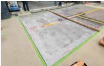
A coat of EA Overlay Primer is applied over the repair area.