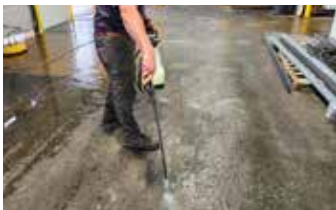
Clean floor with Pro-Grade Cleaner before applying Ecobeton® Vetrofluid.