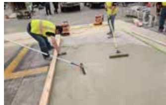
Elephant Armor® is easily placed and levelled with GST Rollers and Squeegee Trowels.