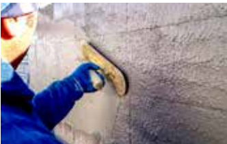
A standard pool trowel is used to spread the Surface Armor™ and achieve an even thickness.