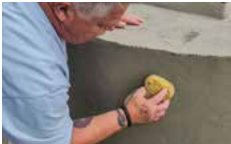
A damp sponge is used to smooth out the Surface Armor® and give it a soft texture.