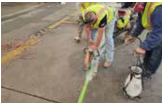
Clean cuts are made around the perimeter of area to be repaired.

A combination of Elephant Armor®, followed by a wear coat of Surface Armor™, was used to complete this major repair. The volume fill, spall and deep crack remediation were performed with Elephant Armor® after Ecobeton-USA® Vetrofluid® was applied to stabilize the existing concrete surface. Surface Armor™ was then used to micro-top the repair, enhancing the surface appearance. A final application of Ecobeton-USA® Vetrofluid® was then applied to greatly improve durability and extend the lifecycle. Elephant Armor® and the Surface Armor™ System significantly reduced costs versus a 'remove and replace' scenario.