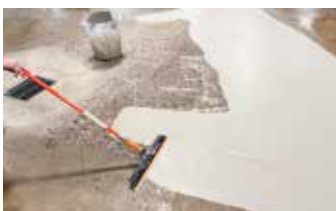
Applying Surface Armor® is quick and easy with a GST Squeegee Trowel.