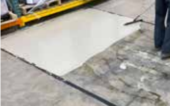
First coat of Surface Armor™ being applied with a GST Squeegee Trowel.