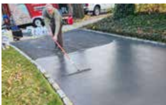
Driveway is given a new visual and service life with a final application of Ecobeton-USA® Vetrofluid®.