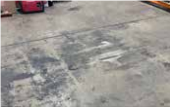
Damaged and unsightly warehouse floor panel prior to resurfacing.