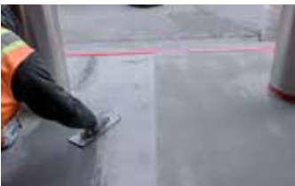
Using a trowel to complete first coat of Surface Armor®.