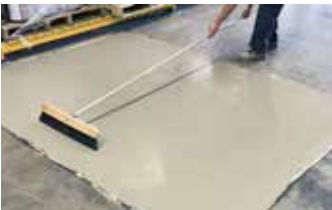
A no-slip broom finish is applied after the second coat of Surface Armor™.