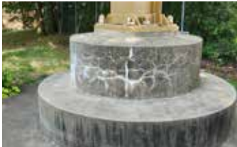
Ageing concrete showing cracking and calcium being released and formation of mold due to water retention.