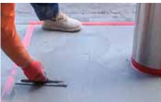
Applying second coat of Surface Armor™ to surface prior to brooming.