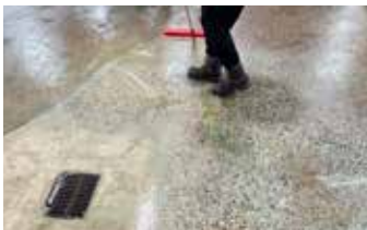
Constant vehicular traffic in a refrigerated wet environment has caused extensive wear.