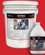
Elephant Armor® Primer