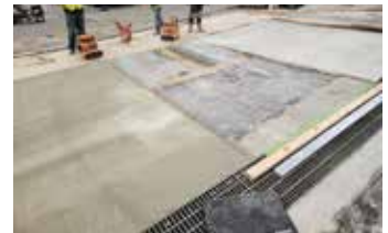
The last panel is ready to be filled and levelled with the two outside panels.