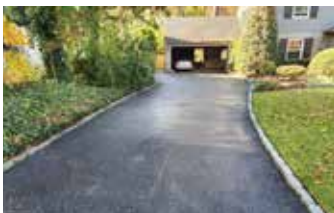
Worn out asphalt driveway prior to applying Surface Armor™.