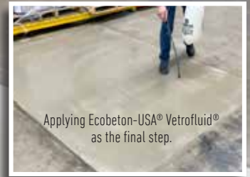
Applying Ecobeton-USA® Vetrofluid® as the final step.