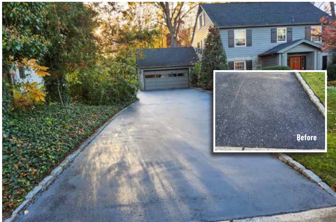
Powder pigment was added to the Surface Armor™ to achieve a similar finish to the original asphalt. The 1250 ft 2 driveway was completely resurfaced in approximately 5 hours.