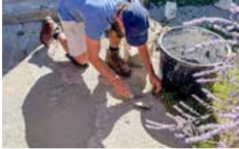
Elephant Armor® DOT used to fill all spalls, deep cracks and displacements. Forming not required.