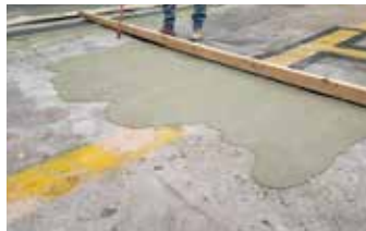
Elephant Armor® is applied in 3 panels to fill and level the repair area.