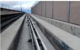
2 coats of Surface Armor™ were applied for durability and texture.