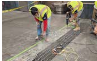
All loose unstable concrete is chipped away to provide a solid surface.