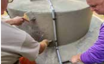
Apply Surface Armor® vertically using a brush, then use a Squeegee Trowel to remove brush marks.