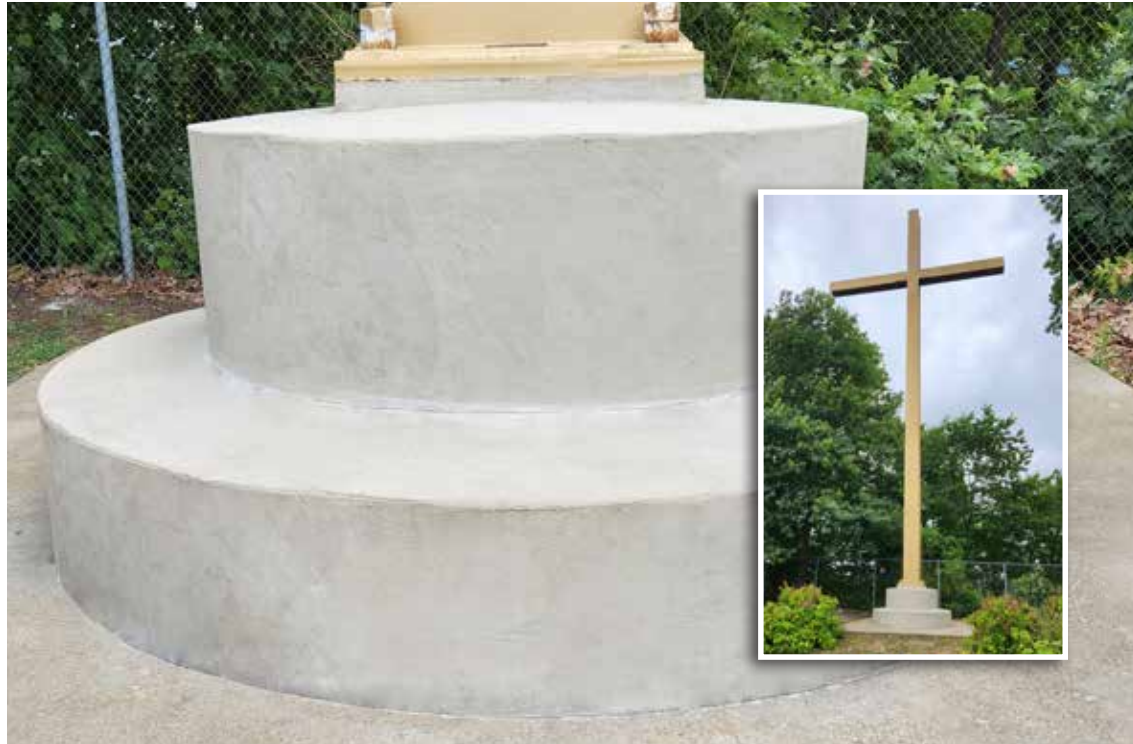
Surface Armor's ease of use and quick set time, allowed the base to be permanently repaired with a minimum disruption to the sanctuary in less than 2 hours!