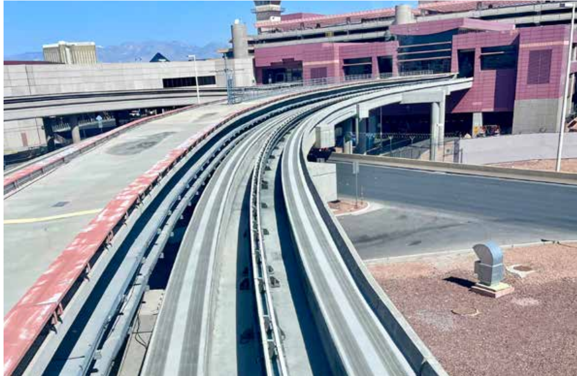
Surface Armor™ replaces traditional epoxies for long lasting, visually attractive appearance and functions at a reduced cost and expedited timeframe.