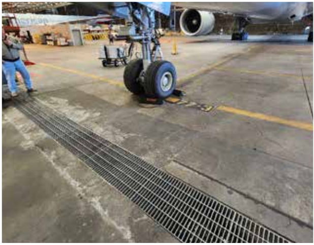
Photo showing extensive damage to the concrete around the drains, including a 3" 'point load' depression in the parking area at the jet's nose gear.