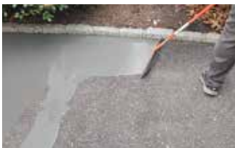
Applying Surface Armor™ is quick and easy with a GST Squeegee Trowel.