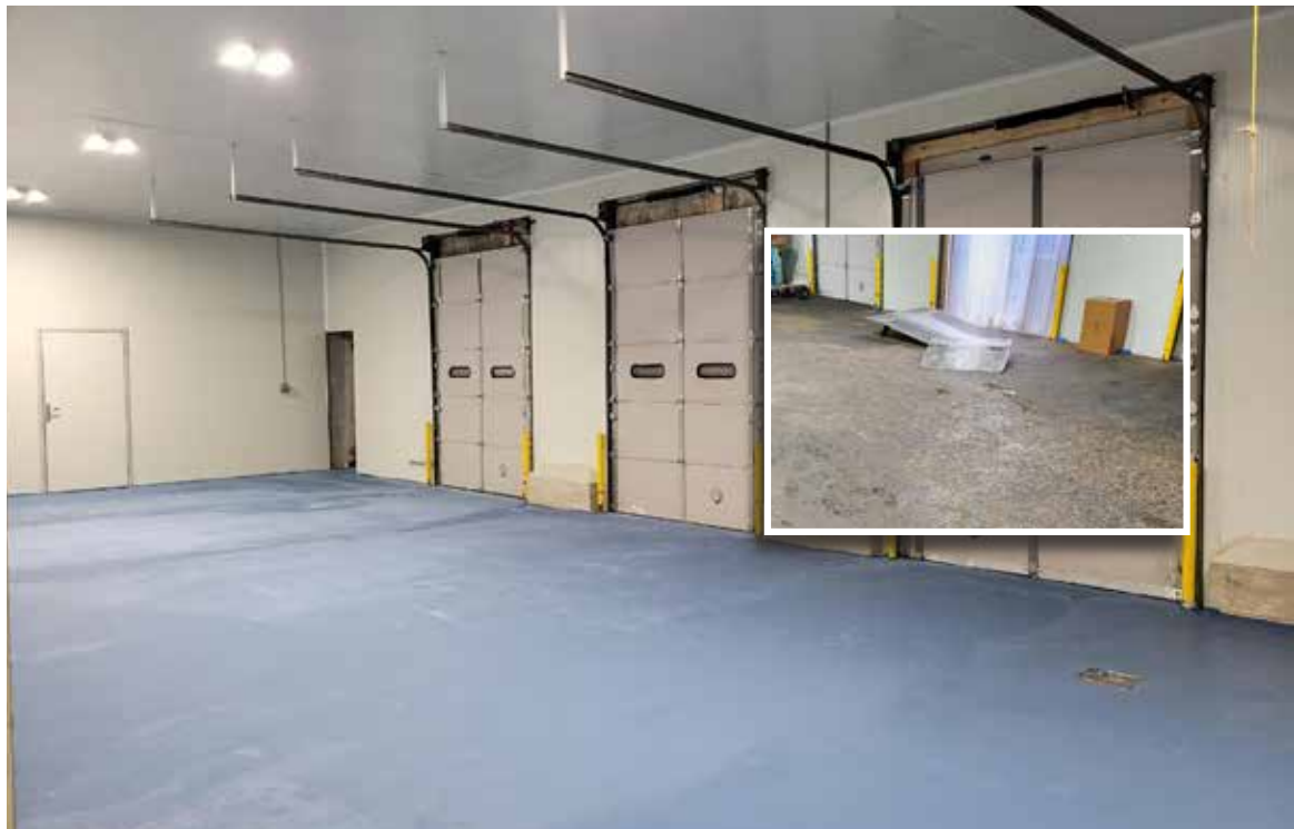
Surface Armor® is a heavy duty cementitious micro-topping that accepts liquid or powder pigments. (not compatible with spray dried granular pigments)