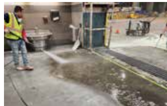
Area to be repaired is washed and all loose material is removed.