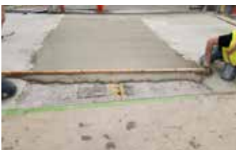
The center panel is filled with Elephant Armor® to the level of the two outside panels.