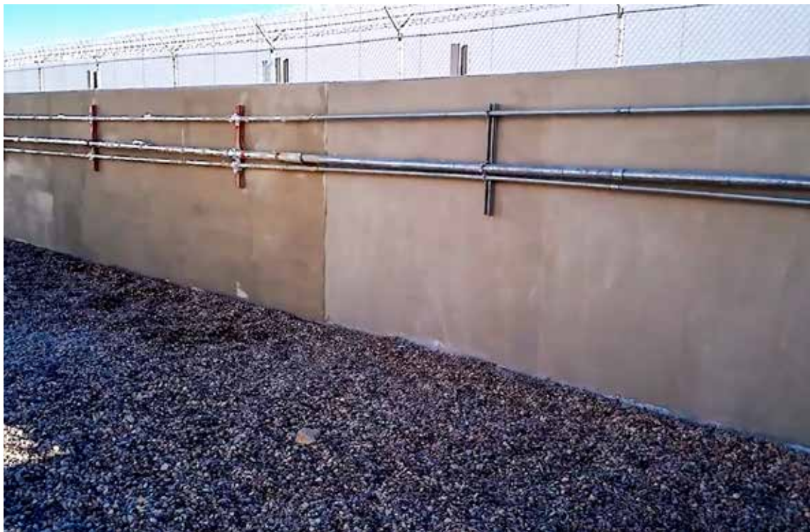
A newly resurfaced CMU block wall with a 'like new' appearance, eliminating the visual cracks and discoloration. The wall is now waterproof and structurally sound.