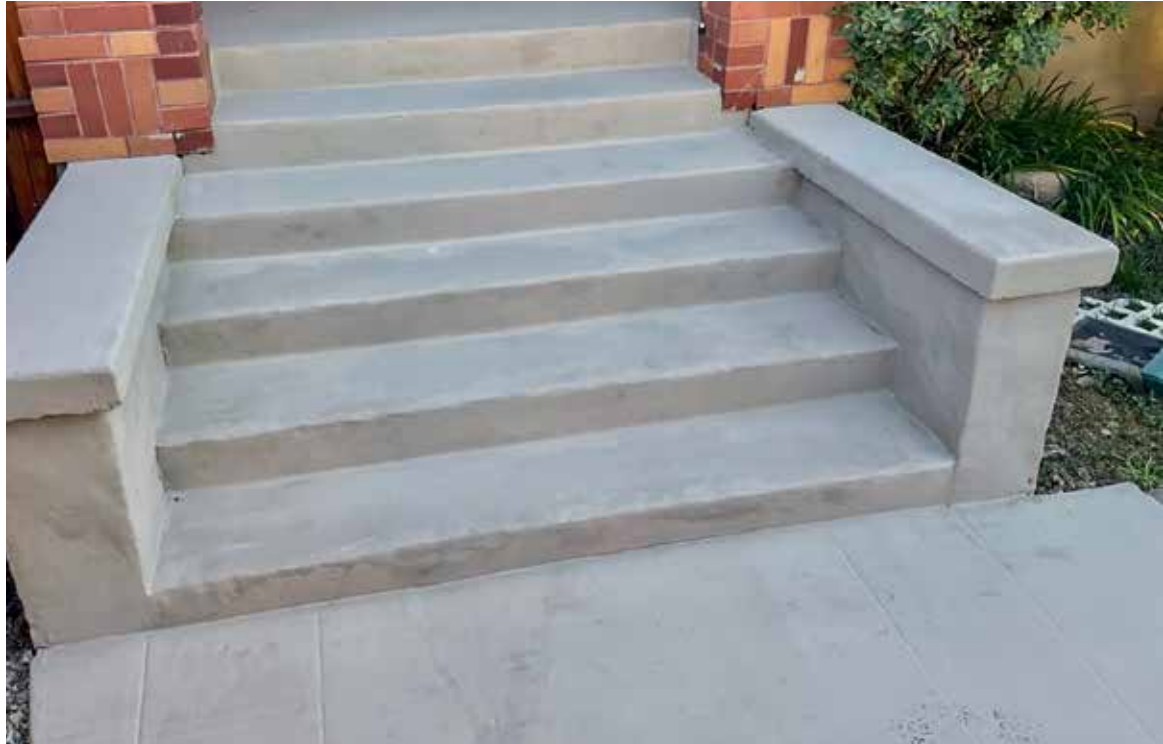
Restoration complete in 5 hours using one bag of Elephant Armor® DOT and one bag of Surface Armor™ without the need for the traditional and extremely costly, time consuming deconstruction/reconstruction process greatly extending its life-cycle.