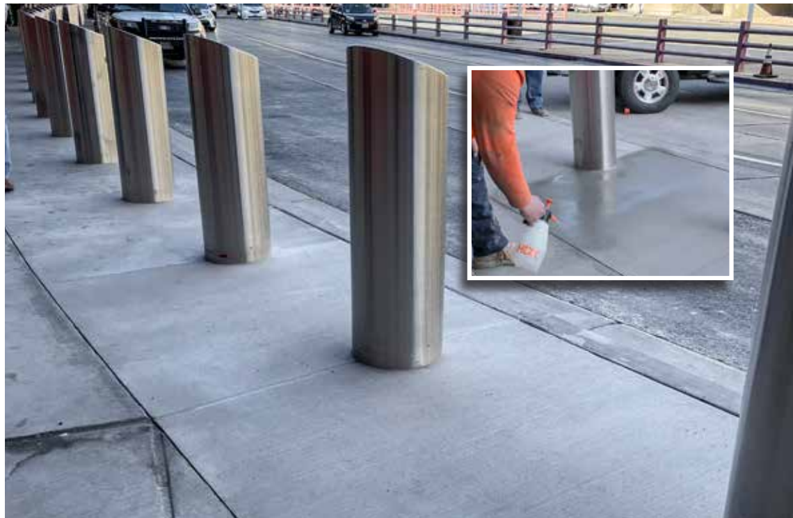
Finished panels showing a new appearance. Inset photo shows Ecobeton-USA Vetrofluid® being applied as the final step of the Surface Armor™ System.