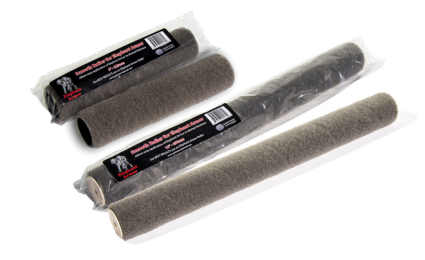
9" (230mm) and 18" (450mm) Smooth Roller