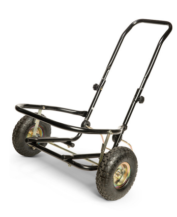
Mixing Bucket Cart Makes moving the mixed Elephant Armor from the mixing station to the placement area faster and easier.