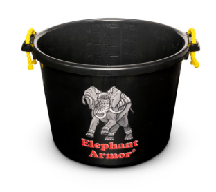
Elephant Armor® Mixing Bucket Rugged 70 quart polypropylene mixing bucket. Use our mixing bucket cart for easy handling.