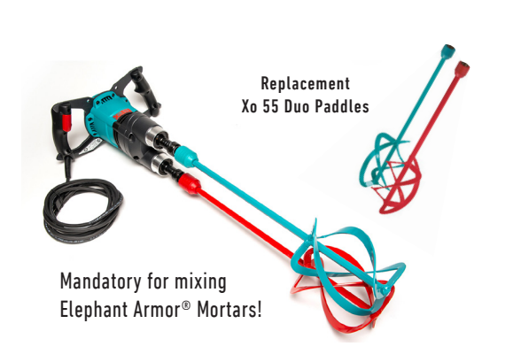
ColloMix Xo 55 Duo – Heavy work made lighter The counter-rotating hand-held mixer makes lots of mixing jobs easier and quicker. There is no counter-torque on the user and the machine is easy to move even in heavy and viscous material. You can generally count on being finished in just half the time.