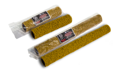
9" (230mm), 9<sup>1</sup>/<sub>2</sub>" (240mm) and 18" (450mm) Textured Roller