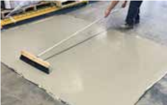
A no-slip broom finish is applied after the second coat of Surface Armor™.