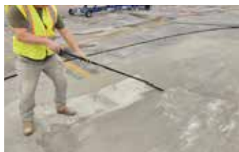
A coat of Surface Armor® is applied over the entire repaired (filled) area.