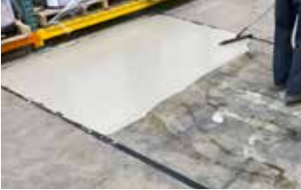
First coat of Surface Armor™ being applied with a GST Squeegee Trowel.