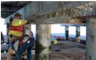
Placing Elephant Armor® over the properly primed surface.