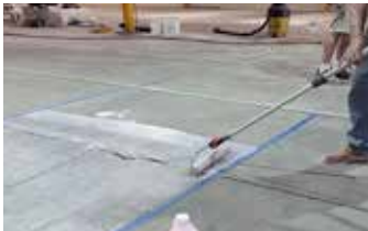
Applying Elephant Armor® Primer.