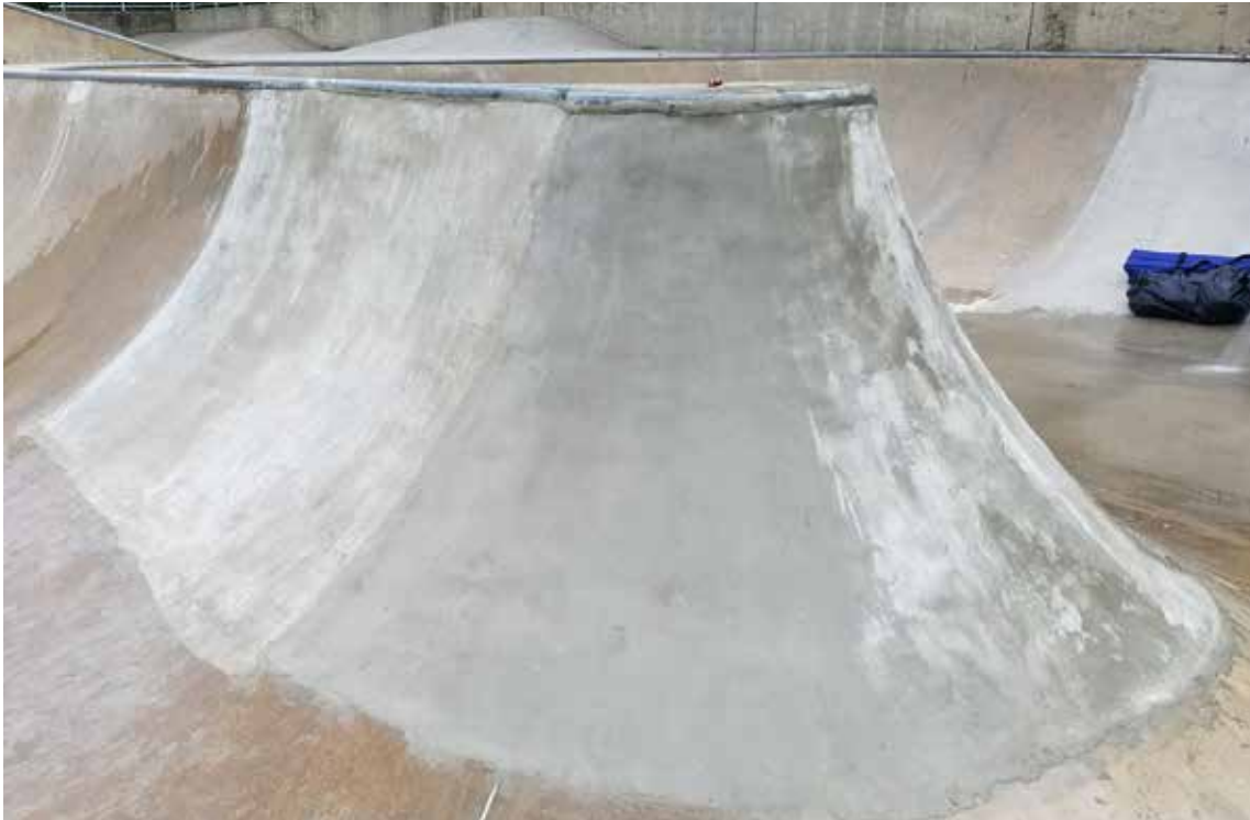
Overlay of degraded failing concrete completed with Elephant Armor®.