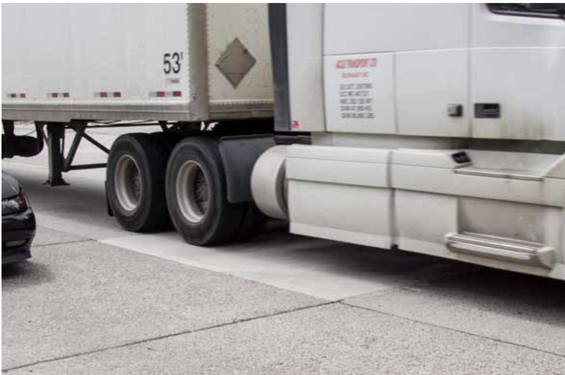
Roadway repaired for use in a matter of hours. Traffic volume in excess of 100 trucks per hour.