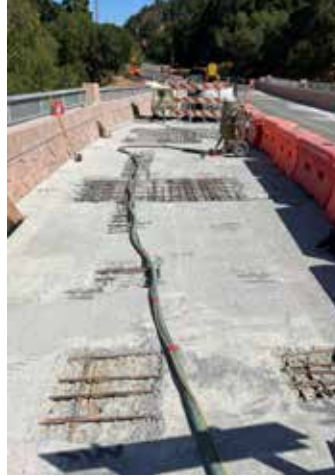
Structural repair area of exposed steel on the bridge deck.