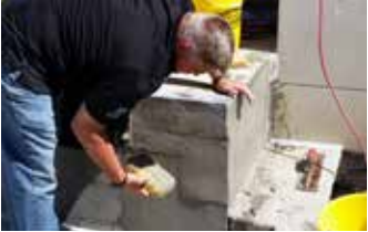
Finishing Elephant Armor®.