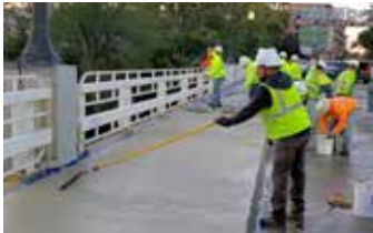
Finishing Elephant Armor® with a GST Squeegee Trowel.