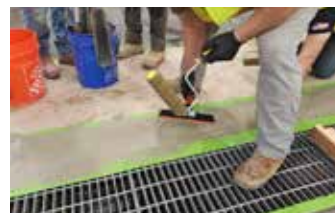
The second damaged area on the outside perimeter of drain is now overlayed with Elephant Armor®.