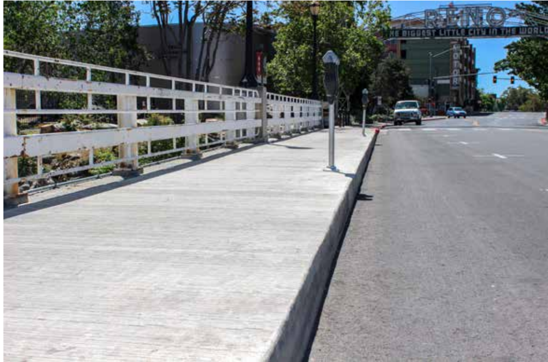
This repair was completed with a return to service in just 4 hours, saving the city weeks of time, money and significantly reducing the environmental impact and disruption of foot and vehicular traffic.