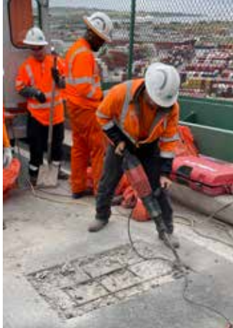
The damaged surface is removed and any loose material is cleaned away with a broom and a blower.