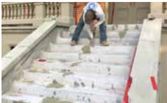
Filling larger cracks prior to full encapsulation.