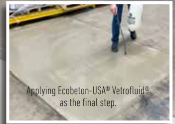
Applying Ecobeton-USA® Vetrofluid® as the final step.