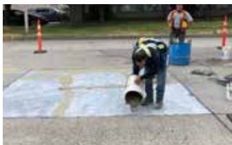
Area prepared with Elephant Armor® Primer.