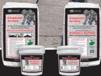
Elephant Armor® DOT