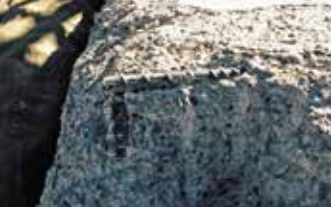
Spalled concrete with exposed rebar.