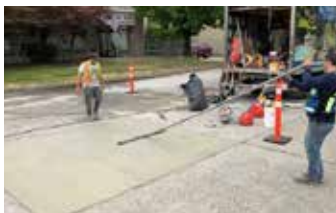
Finishing placement of quarter inch Elephant Armor® overlay.