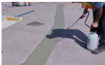
Finishing Elephant Armor® repair with an application of Ecobeton® Vetrofluid®.