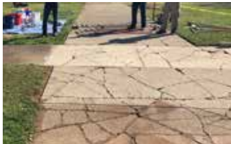
Severely cracked sidewalk panels prior to Elephant Armor® repair.