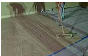
Applying first lift of Elephant Armor® over waterproofing membrane.