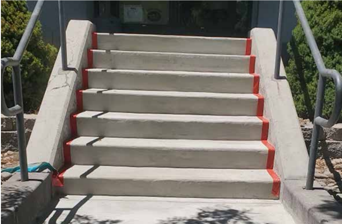
Severely weathered and broken stair treads made new, extending the lifecycle with Elephant Armor®. Repair completed by Morgan Construction, Reno, NV.