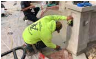
Finishing vertical wall repair.