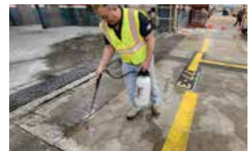
A coat of Ecobeton®-USA Vetrofluid® is applied to stabilize the existing concrete.