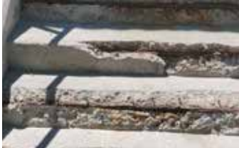
Concrete stairs degraded down to exposed steel.