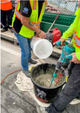
Elephant Armor® is easy to prepare, just add water. A ColloMix Xo 55 Duo is required for generating the high shear needed to achieve a homogenous mix.