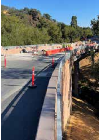
Alimitos Bridge in Santa Clara County, California