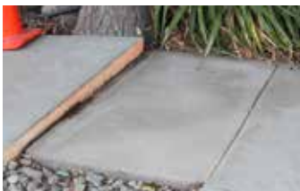
Extreme trip and fall hazard.