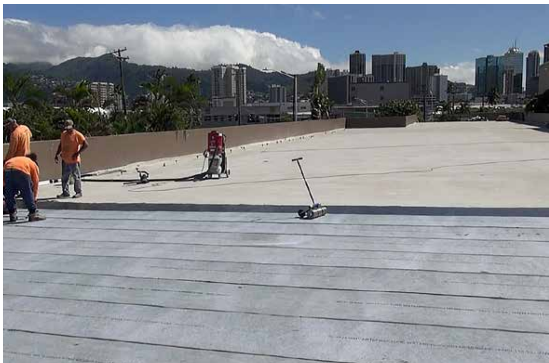
Elephant Armor® is the ideal concrete repair and overlay solution for failing infrastructures with substantial time and cost savings.