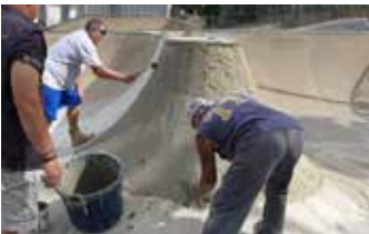
Elephant Armor® applied with GST Rollers and trowels without forming.