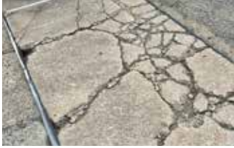
Severely degraded concrete panel ready for a 'fill and cap' application.