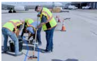
Filling cracks with Elephant Armor® using a roller and squeegee.