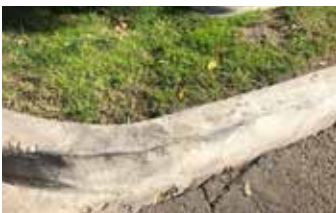
Finished curb can take immediate vehicular abuse.