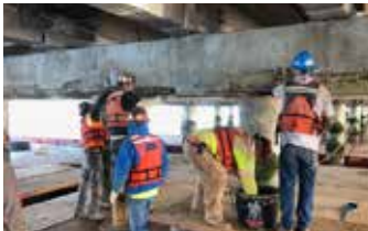
Applying a slurry primer coat over the repair area ahead of Elephant Armor® placement.