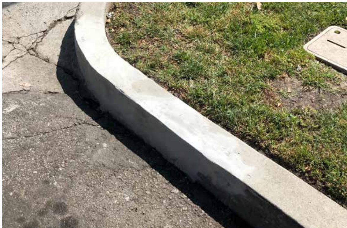
Finished curb repair completed in less than an hour.