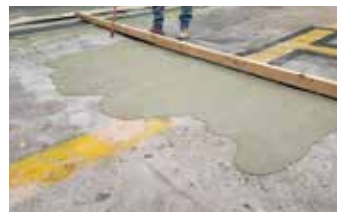
Elephant Armor® is applied in 3 panels to fill and level the repair area.