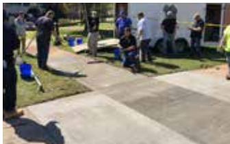
Using a GST Squeegee Trowel prior to applying a broom finish.