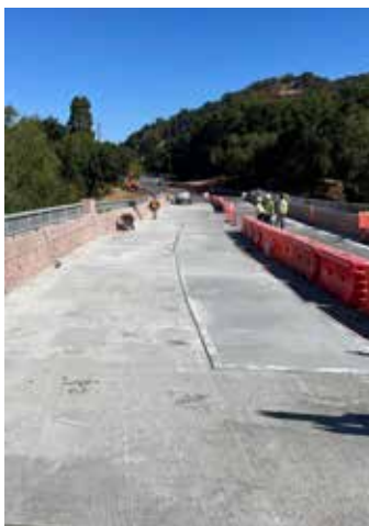
The first overlay is cured and ready for the second 1/2" lift.