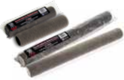
9" (230mm) and 18" (457mm) Smooth Roller