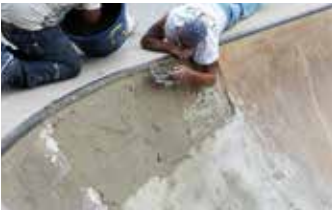
Elephant Armor® applied after primer coat.