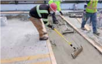
Placement of material using GST Texture Rollers.