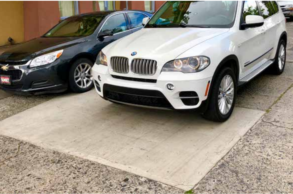
Repaired road panel 5 years after installation is still performing perfectly. With minimal environmental impact by significantly reducing the time of repair, a new lifecycle is achieved while also reducing repair costs by as much as 50%.