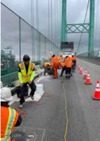
Photo showing a deteriorating asphalt filled pothole on a concrete bridge deck.