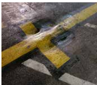
Damaged concrete surface unsafe for use.

The massive weight distributed on the pavement at the gate is apparent in this picture. The indentations in the pavement are caused by the point load of the planes front wheels. International Airports are extremely busy and cannot be shut down for routine maintenance.