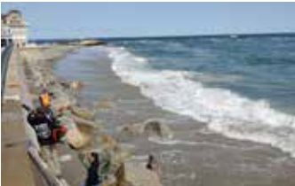
Repair completed during low tide cycle.