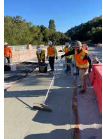
The first 1/2" lift overlay being applied to the bridge deck.