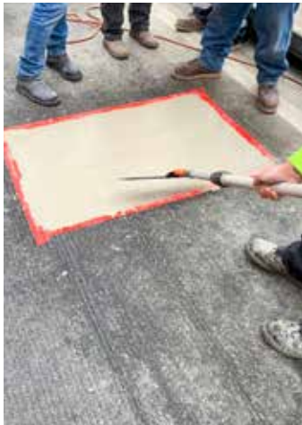
A GST Squeegee Trowel is used to smooth out the Elephant Armor®.