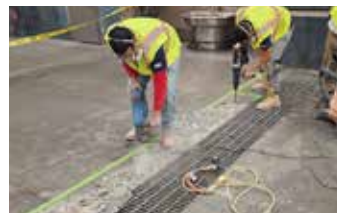
All loose unstable concrete is chipped away to provide a solid surface.