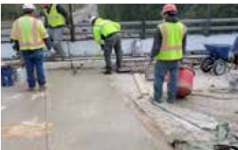
Putting final finish on new bridge link.