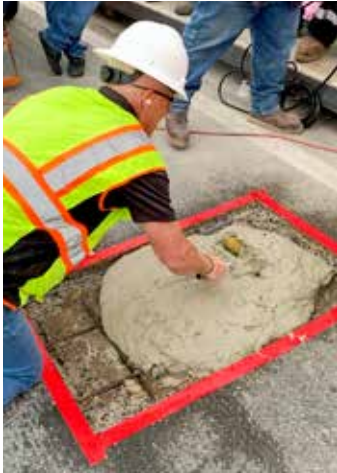
A GST Textured Roller is used to place and evenly spread out the high fiber mix design of Elephant Armor®.