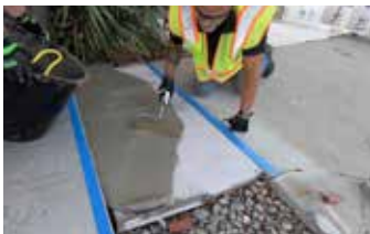
Applying Elephant Armor® using a GST Texture Roller.