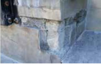
Extreme damage to loading dock.