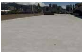
Repair complete and ready for use.