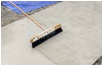
After GST Squeegee Trowel is used to smooth the surface, a broom finish is applied.