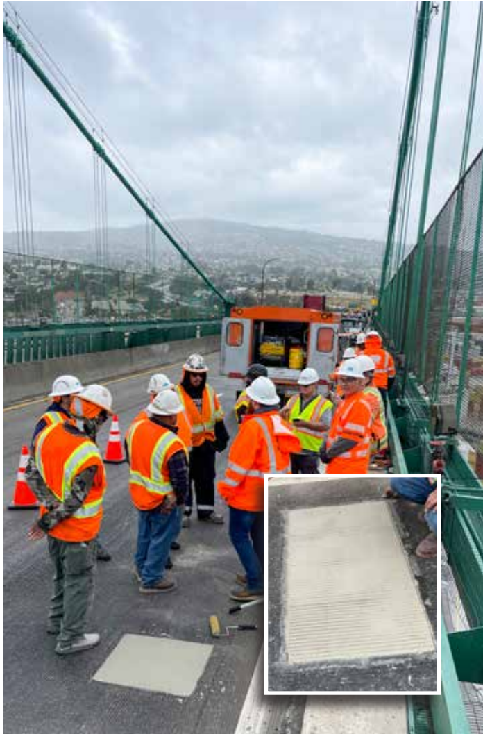
Elephant Armor's ease of use and quick set time, allowed the pothole to be permanently repaired with a minimum disruption to bridge traffic. This lane was back to service in less than 3 hours!