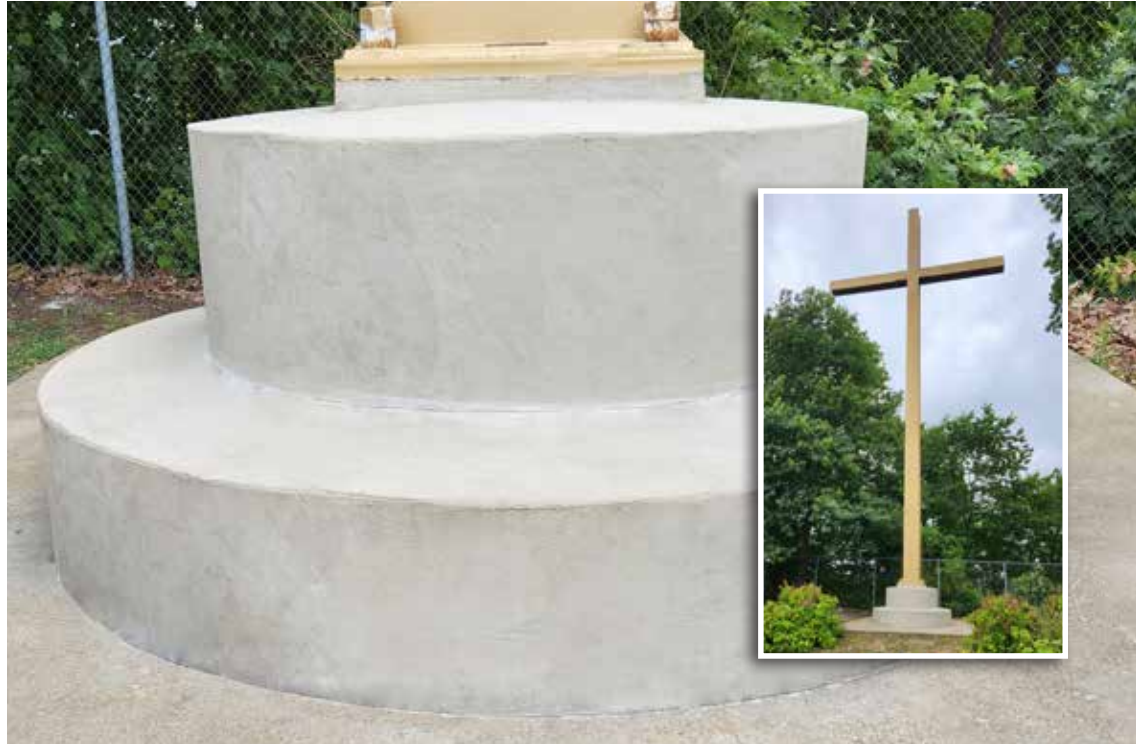
Surface Armor's ease of use and quick set time, allowed the base to be permanently repaired with a minimum disruption to the sanctuary in less than 2 hours!