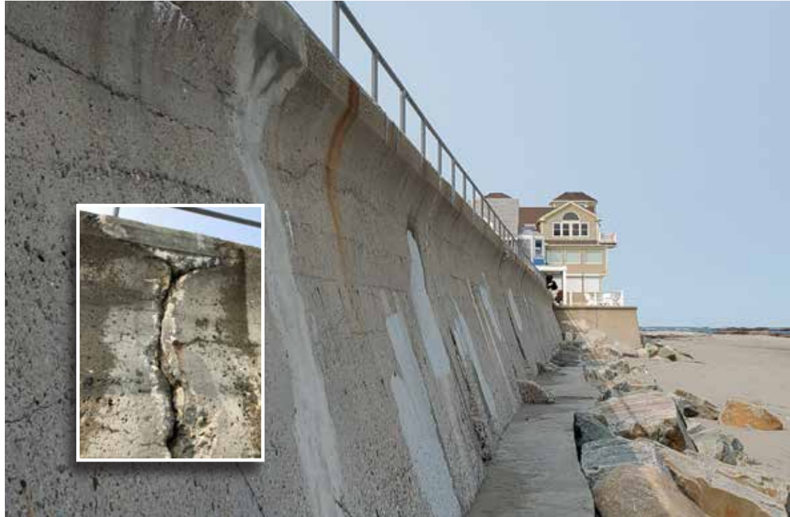
Severe fracturing of old seawall due to saltwater and weather exposure given new life using Elephant Armor® DOT.