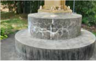
Ageing concrete showing cracking and calcium being released and formation of mold due to water retention.