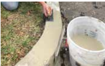
Finishing curb repair with edging tool.