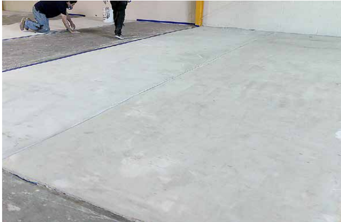
The installation was completed in sections allowing for uninterrupted use of the warehouse, saving 80% of the original remove and replace estimate.