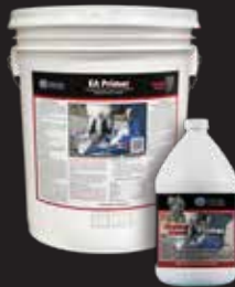
Elephant Armor® Primer