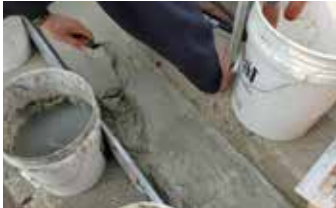
Elephant Armor® applied without using forms.