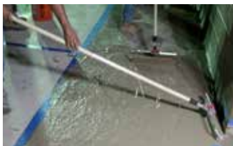
Applying second lift of Elephant Armor®.