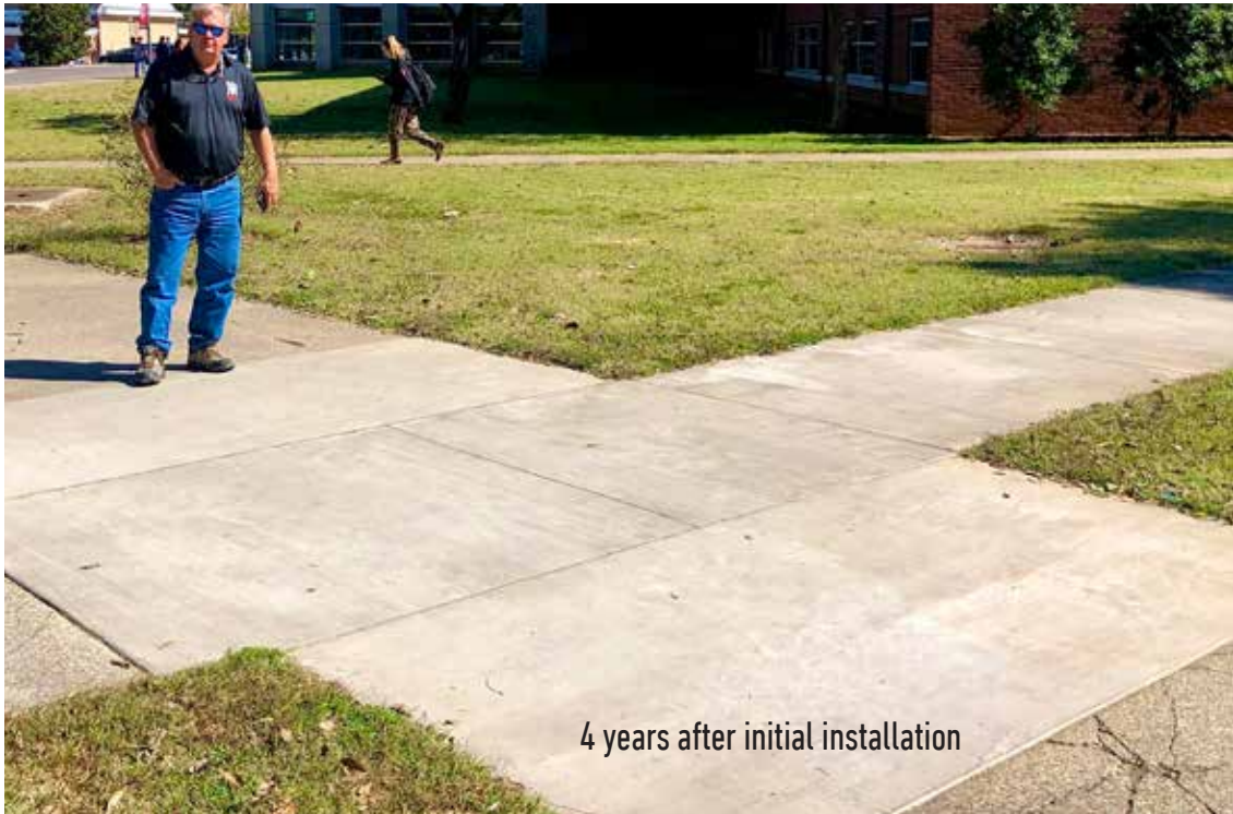
4 years after initial installation

A sidewalk repair demonstration was performed at MTSU in conjunction with their CIM program to compare traditional 'Remove and Replace' repair methods with Elephant Armor® encapsulation. The study proved that using Elephant Armor® reduced the repair time by over 80% and significantly lowered the repair cost.