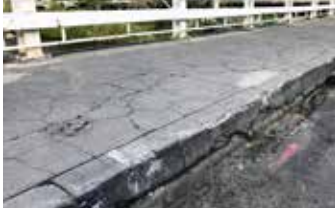
Badly cracked and spalled concrete sidewalk.