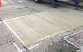
Repair completed in two hours and open to traffic in four hours.