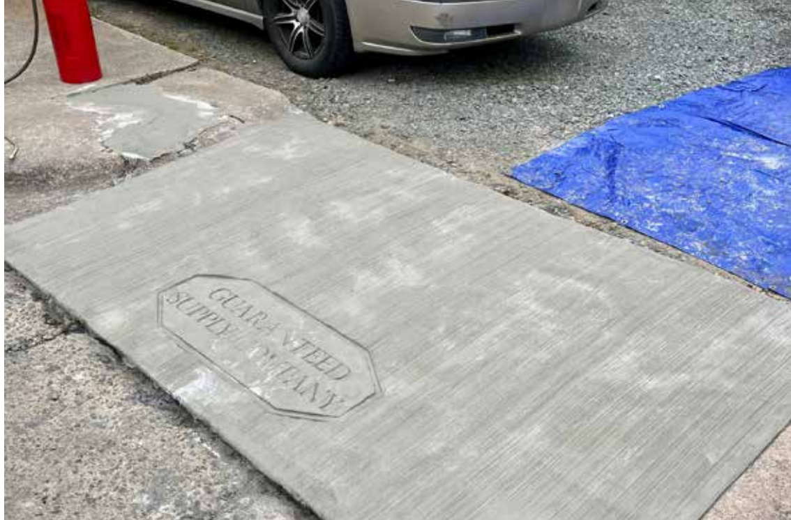
Finished repair stamped with Guaranteed Supply Company logo. Ecobeton®-USA VetroFluid® is applied as a last step after the Elephant Armor® repair has achieved a full cure.