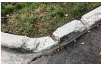
Severely damaged curb.