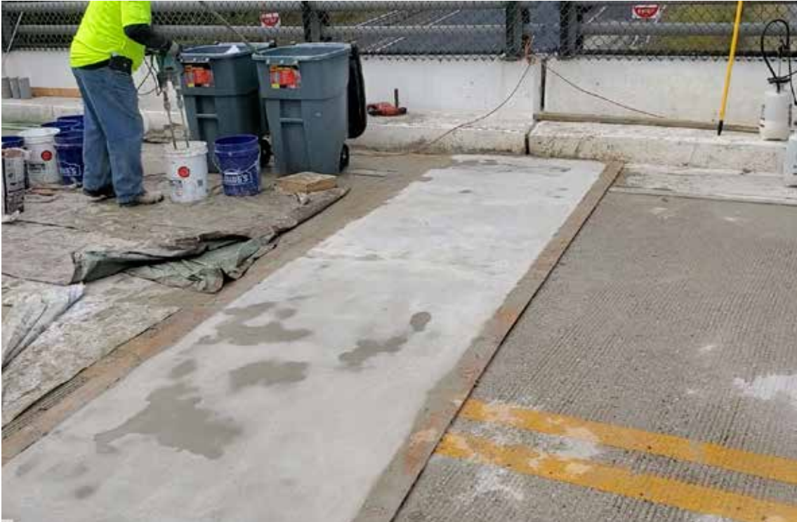
Bridge link construction completed in just 4 hours. Elephant Armor® was chosen due to its high compressive, flexural and tensile strength. Its fast setting properties allow for minimal shut down time and a quick return to service.