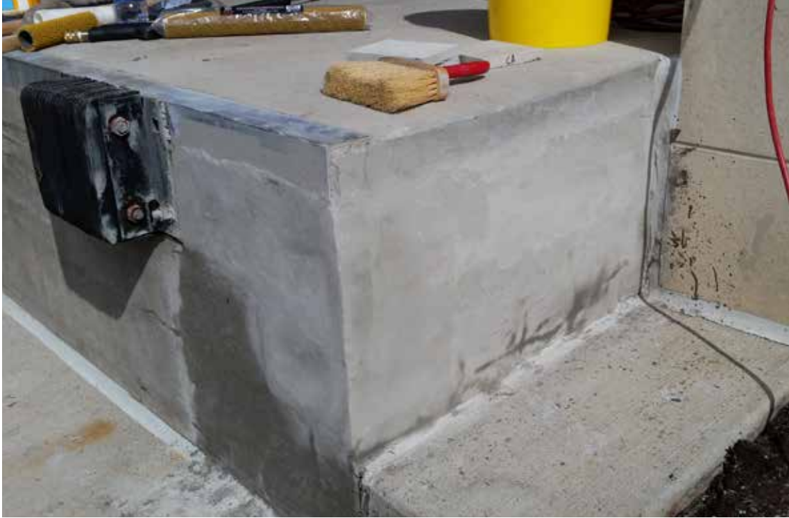
Damaged loading dock repaired without the need of forming and a lengthy interruption of service.