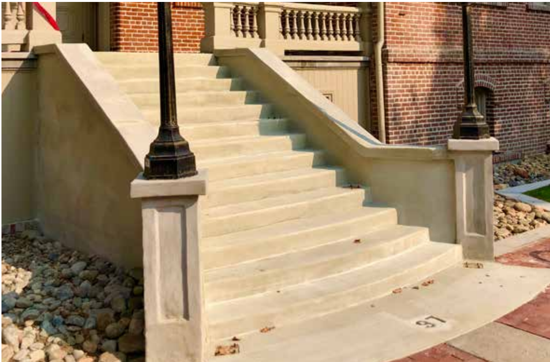
Damaged concrete stairs overlaid without deconstruction or forming, saving time, money and reducing the disruption of service.