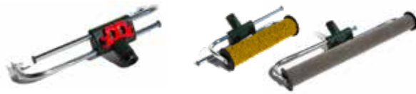
Expandable Aluminum Roller Frame ( rollers not included ) Showing Expandable Roller Frame at 9" to 18" with 1/4" and 1/2" depth gauges ( sold separately )