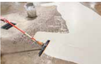
Applying Surface Armor® is quick and easy with a GST Squeegee Trowel.