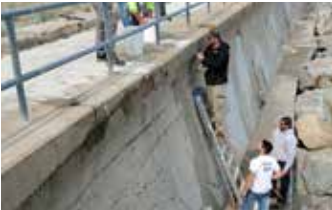
Applying Elephant Armor® to repair area.