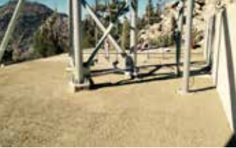
CBS TV Tower completed reconstruction in just 4 days.