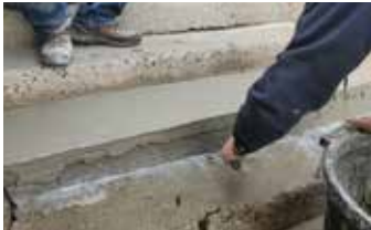
Putting finishing touches on the repair.