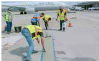
Elephant Armor® cap is placed using an edging trowel and squeegee.