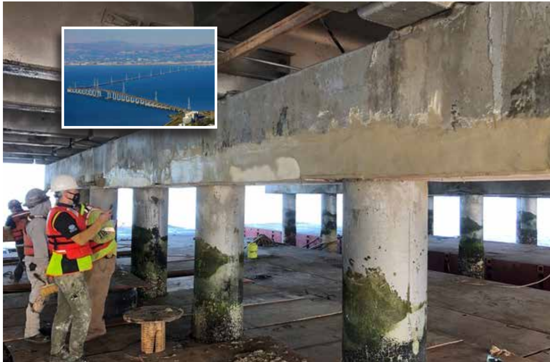
CalTrans using Elephant Armor® DOT on a 3 year project to bring the bridge back to its original specification without having to fully deconstruct and reconstruct the failing 1100 columns.