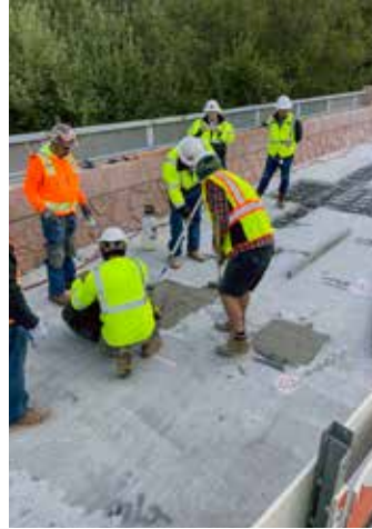
Applying Elephant Armor® as a fill material around the exposed steel.