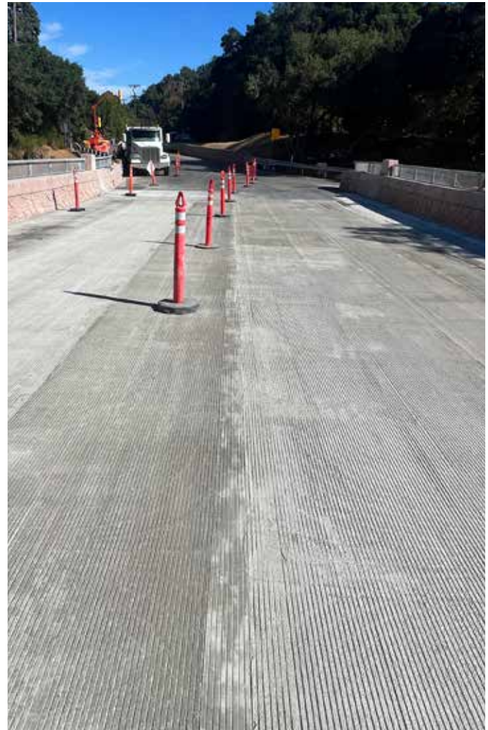
Completed bridge deck resurfacing taking approximately just one week to perform.