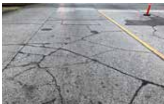
Distressed concrete roadway.