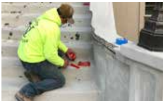
Severely broken and degraded wall cap.