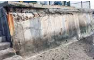
Severely degraded seawall.