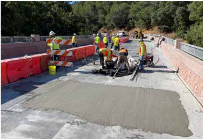
Areas with exposed rebar are filled and encapsulated with Elephant Armor® prior to final overlay application of Elephant Armor® DOT.