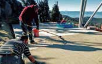
Elephant Armor® applied with GST rollers and trowels.