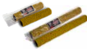
9" (230mm) and 18" (457mm) Textured Roller