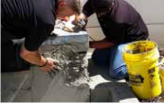
Applying Elephant Armor® to the vertical surface without forming.