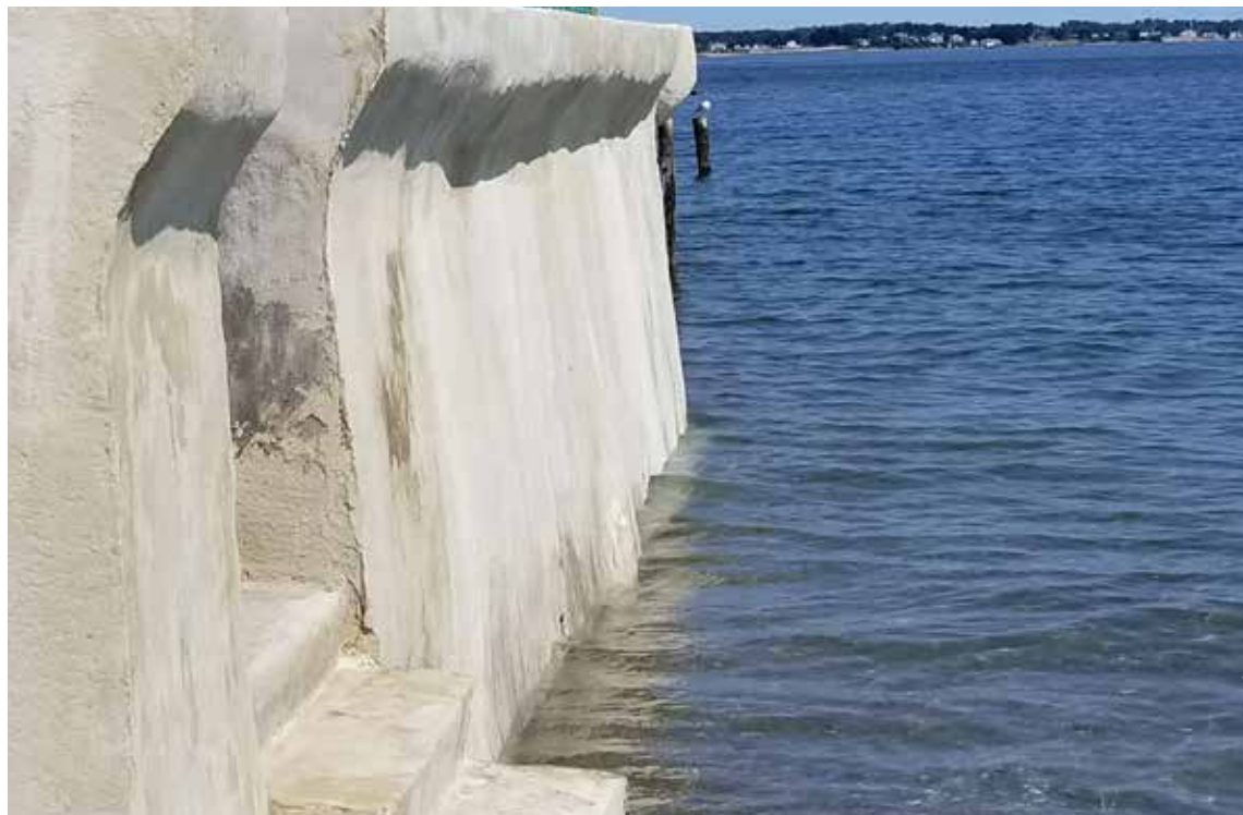
Full degraded seawall encapsulation completed between tides.