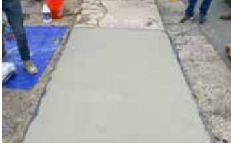
After cracks are pre-filled, a 1/4" lift of Elephant Armor® is applied to the surface.