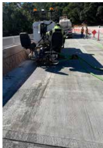
After the second lift has cured, a grooving machine applies the specified texture.