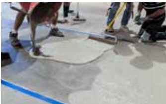
GST Gauged Rollers are used to apply Elephant Armor® at a consistent 1/4" thickness.