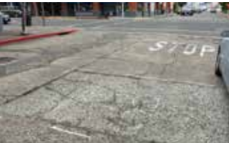
Failing road panel.