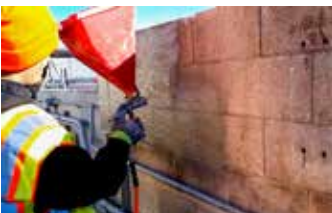
Surface Armor™ is sprayed on the degraded block wall after an initial application of Vetrofluid®.