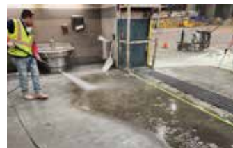
Area to be repaired is washed and all loose material is removed.