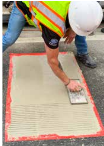
A tining trowel is then applied to the surface to match the existing bridge deck grooved surface.