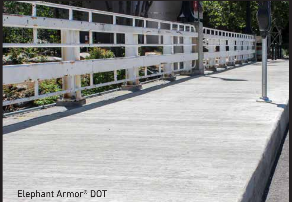
Elephant Armor® DOT