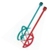
Replacement Xo 55 Duo Paddles

ColloMix Xo 55 Duo – Heavy work made lighter Due to Elephant Armor's heavy fiber load, that results in a highly viscous mix, the ColloMix Xo 55 Duo is mandatory for generating the required high shear needed to achieve a homogenous mix in Elephant Armor® mortars. You can generally count on being finished in just half the time.