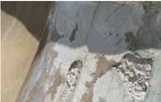
Damaged concrete surface unsafe for use.