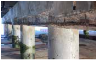
Damaged and unsound concrete removed and prepped for Elephant Armor® placement.