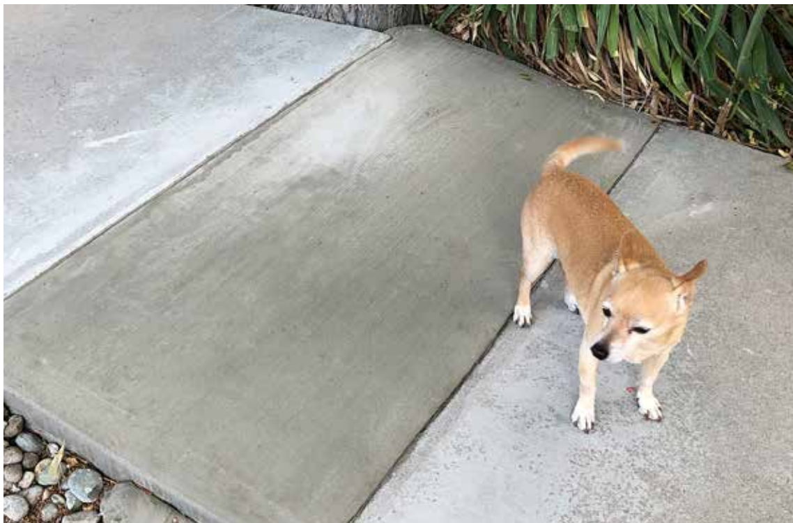
Trip and fall hazard was eliminated without having to remove the failing panel.