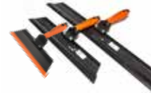
Squeegee Trowels Place and finish Elephant Armor® quickly and easily. Available in 12", 18" and 26" blade widths.