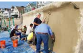
Using GST Texture Roller for final placement.