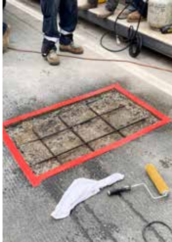
The clean and stable repair area is 'surface saturated dry' (SSD) prior to the placement of Elephant Armor®.