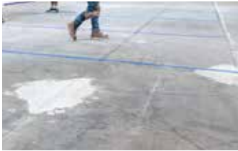
Defining repair area by saw cutting and taping.