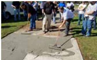
Applying a slurry coat and crack fill with Elephant Armor®.