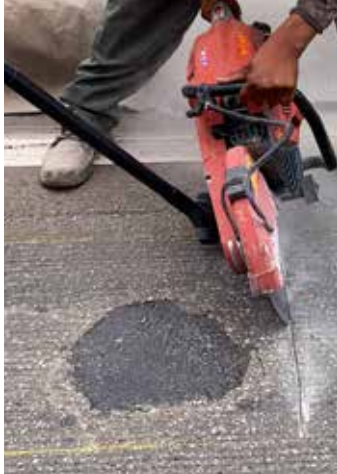
It is important to make clean cuts around the perimeter of area to be repaired.