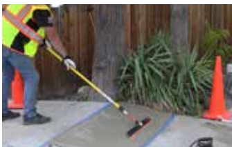
Preparing the surface for a broom finish.