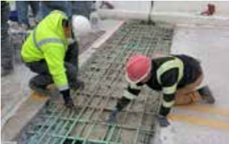
Elephant Armor's flowable mix ensures steel encapsulation.