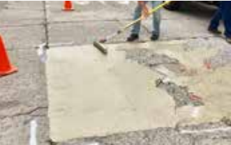
Application of quarter inch Elephant Armor® overlay.