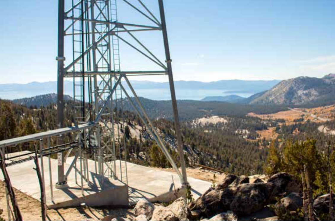
Elephant Armor® was successfully used in the harsh and remote environment of Mount Rose in the Sierra Nevada Mountains, where access with conventional methods would be very costly.