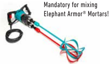
Mandatory for mixing Elephant Armor® Mortars!

ColloMix Xo 55 Duo – Heavy work made lighter Due to Elephant Armor's heavy fiber load, that results in a highly viscous mix, the ColloMix Xo 55 Duo is mandatory for generating the required high shear needed to achieve a homogenous mix in Elephant Armor® mortars. You can generally count on being finished in just half the time.