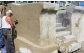
Placing Elephant Armor® on vertical wall.