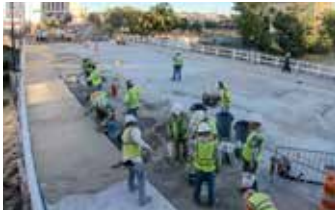
Placing Elephant Armor® using GST specialized tools.