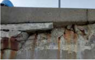
Broken and spalled seawall.