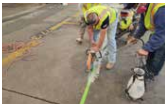
Clean cuts are made around the perimeter of area to be repaired.

A combination of Elephant Armor®, followed by a wear coat of Surface Armor™, was used to complete this major repair. The volume fill, spall and deep crack remediation were performed with Elephant Armor® after Ecobeton-USA® Vetrofluid® was applied to stabilize the existing concrete surface. Surface Armor™ was then used to micro-top the repair, enhancing the surface appearance. A final application of Ecobeton-USA® Vetrofluid® was then applied to greatly improve durability and extend the lifecycle. Elephant Armor® and the Surface Armor™ System significantly reduced costs versus a 'remove and replace' scenario.