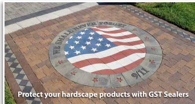
Protect your hardscape products with GST Sealers

Lock 'N Seal is GST International's state of the art sealer and joint sand stabilization product, which provides superior joint stability while enhancing and protecting the pavement.