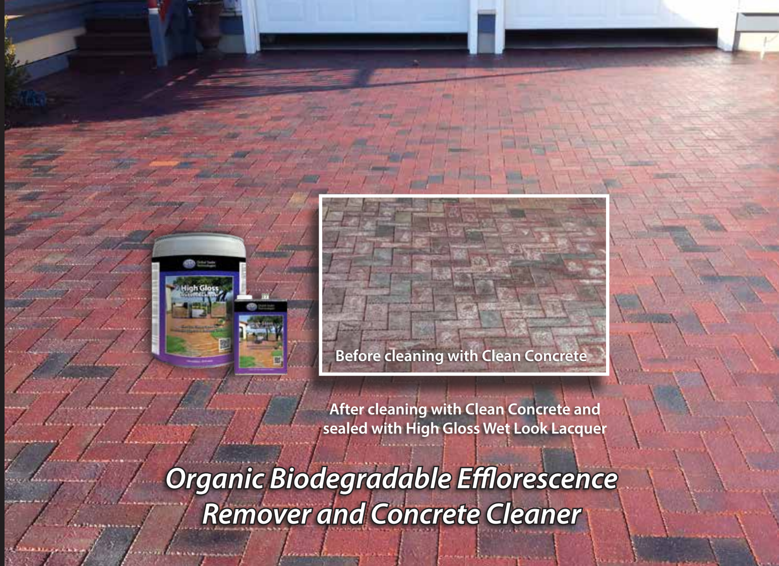
Before cleaning with Clean Concrete